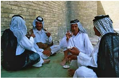
Men drinking tea, An Nataf, Iraq

For the sake of simplicity this guide to the region will look at Arab culture and the religion of Islam at a general level. Many of the basic principles will also apply to Turks, Kurds and Iranians but they should always be approached as autonomous peoples.