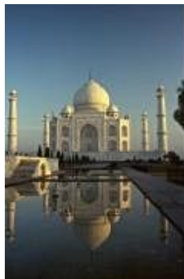
Taj Mahal in the morning.

Hinduism: over 80% of Indians are Hindus. Hinduism has no founder or prophet and reincarnation is its basic tenet. Hindus believe their present position in life is on account of their karma or actions in past lives. People live their lives in accordance with a predetermined destiny, and life is a cycle of births and rebirths. The ultimate quest is for moksha or liberation from the life cycle by living a pure and perfect life. Popular Hindu deities include Brahma, the creator, Vishnu, the preserver, and Shiva, the destroyer. The three are often depicted in a trinity.